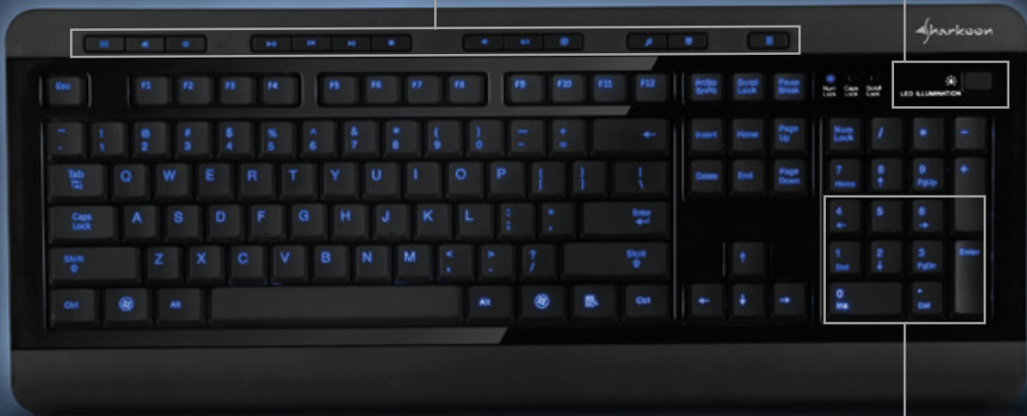
Low profile key design